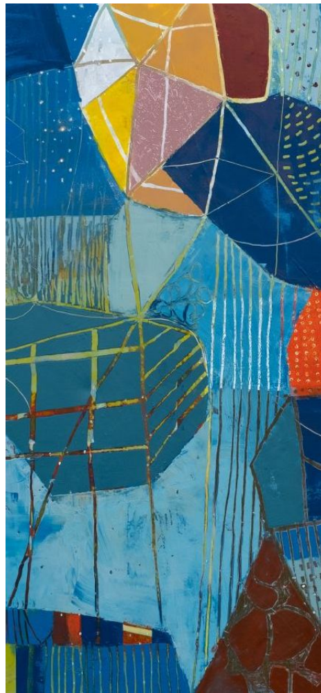
Held Together by String, oil on canvas, 2019